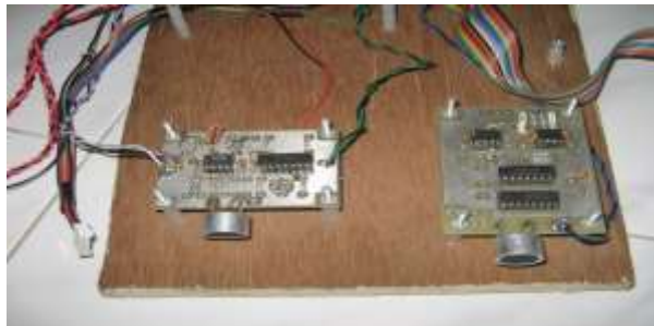
Fig. 2. Ultrasonic Transmitter and Receiver Circuit

In this paper, we describe such a measurement system which uses ultrasonic transmitter and receiver units mounted at a small distance between them.