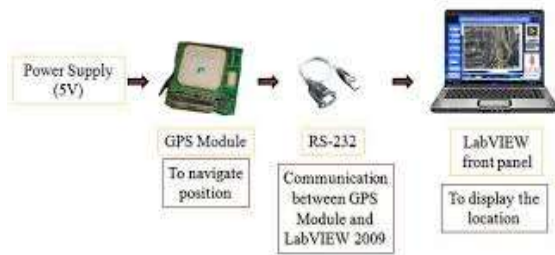
Fig.3. GPS System Overview

GPS receivers are used for navigation, positioning, time dissemination, and other research. Receiver displays real time data, which is speed and position. To store this data it is transferred to RAM of ARM 11[8]. It is then transferred to PC using RS 232 protocol [10].